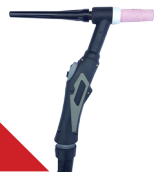
TIG 26 Torch