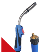
MB36 Euro Torch