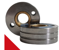
"U" Aluminium Roller