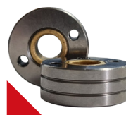
"K" Flux cored Roller